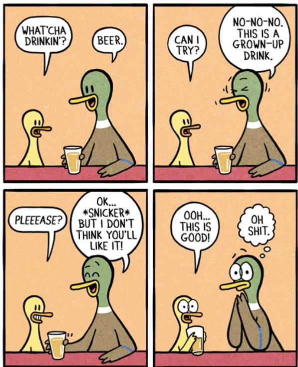
FowlLanguageComics.com