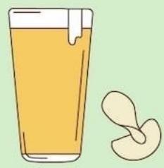
LAGER + UNSALTED