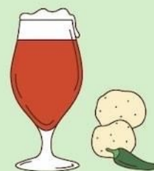
GRAPEFRUIT IPA + JALAPEÑO