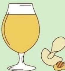
SAISON + HONEY DIJON