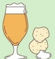
IPA + SOUR CREAM & ONION