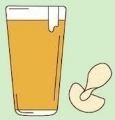
PILSNER + SALTED