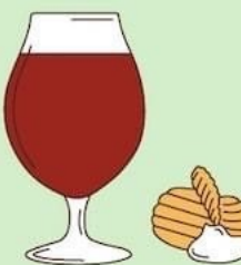
FLEMISH RED ALE + CHEDDAR & SOUR CREAM