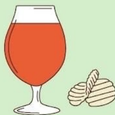
ESB + SALT & VINEGAR