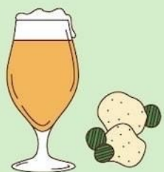
KÖLSCH + DILL PICKLE