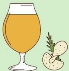
GOSE + ROSEMARY