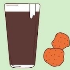
PORTER + BARBEQUE