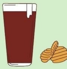
BELGIAN DUBBEL + SWEET POTATO