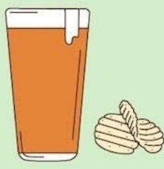
PALE ALE + SALT & PEPPER